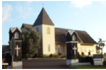
Holy Cross Church, Kalaheo